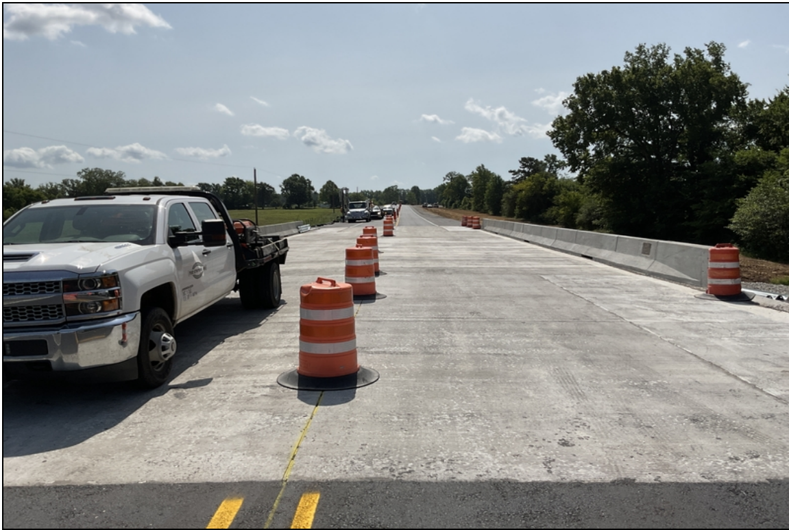
Roadway with Log Mile running West to East.